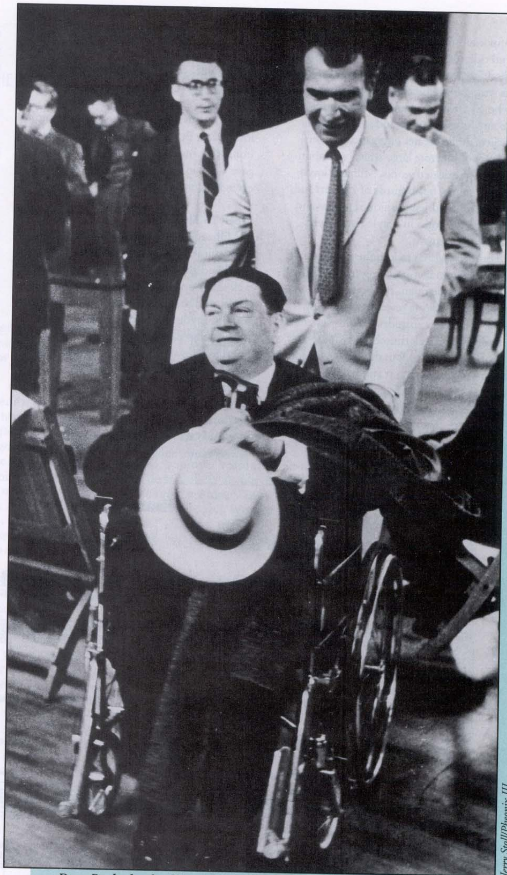
Dave Brubeck takes his teacher, Darius Milhaud, to a concert of Milhaud's music at San Francisco State University in 1949.

A further bit of psychoanalysis will help to illuminate their respective compositional styles and show why Milhaud was so