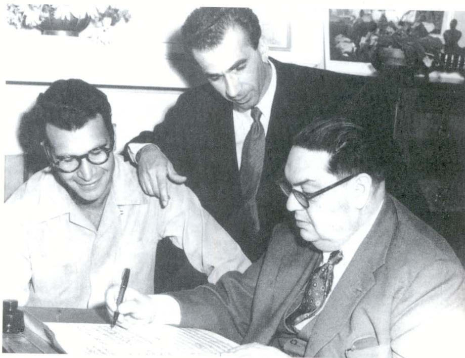
Brubeck (left) was a student of Darius Milhaud (right). The man standing is unidentified.

Copyright © 1993, 1994 Derry Music Company. Used With Permission.